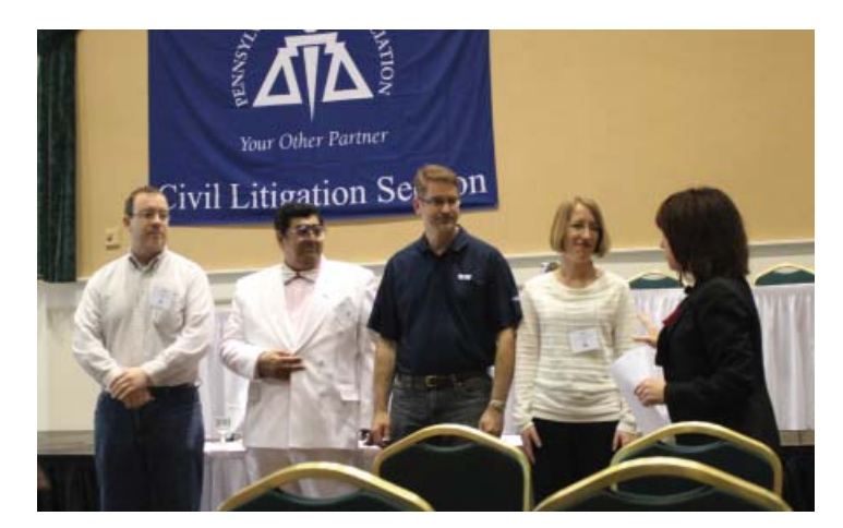
Learning "Communication Skills for Battles in the Courtroom"