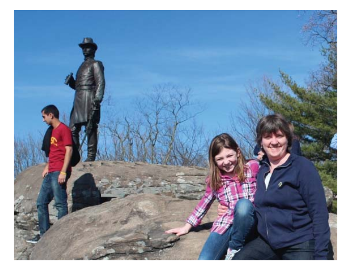
Members and their families enjoyed touring the monuments at Gettysburg National Park.