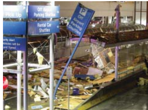
April 22, 2011 Tornado rips through St. Louis' Lambert Field

PIA Presse Internationale des Assurances